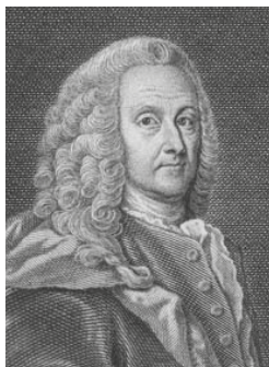
L. Holberg

This design is part of a little collection inspired by the works of the famous Danish-Norwegian poet and author Ludvig Holberg . Holberg lived from 1684-1754, and even though this is a long time ago, he had a very special talent for showing – and exposing – different types of people, which is a big part of what makes him relevant still today.