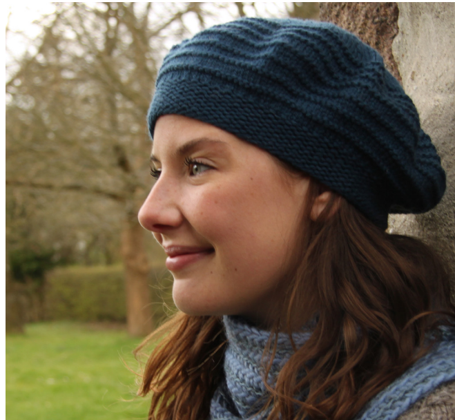
Hat in Peruvian Highland Wool (PHW)