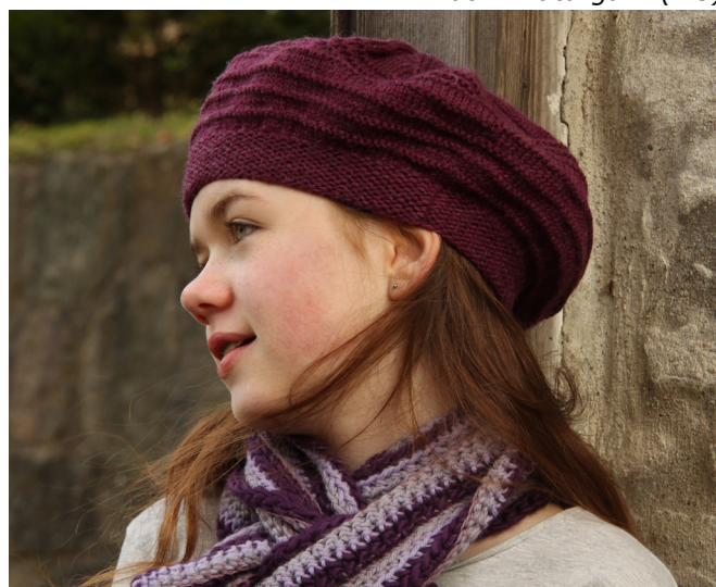
Hat in 2 strands of Arwetta Classic (2xAWC)