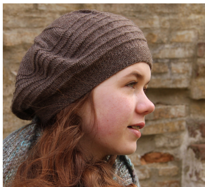
Hat in 1 strand of Arwetta Classic (1xAWC)