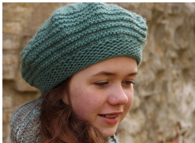
Hat in Naturgarn (NG)