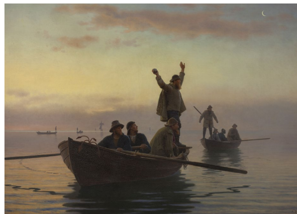
A. Dorph, Hornfiskefangst med drivvod, 1880 Statens Museum for Kunst Public Domain

as above every 4th round a total of 24 (25) 26 (27) times. There are now 100 (106) 112 (118) sts on the needle. Work straight in pattern until the sleeve measures approx. 46 cm or the desired length. End on the same row of the pattern as on the body.