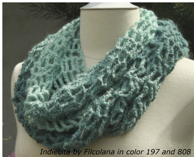
Indiecita by Filcolana in color 197 and 808

The cowl is crocheted holding two strands of the yarn together. The pattern uses UK terms.