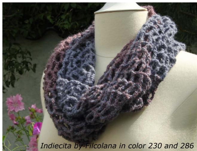
Indiecita by Filcolana in color 230 and 286