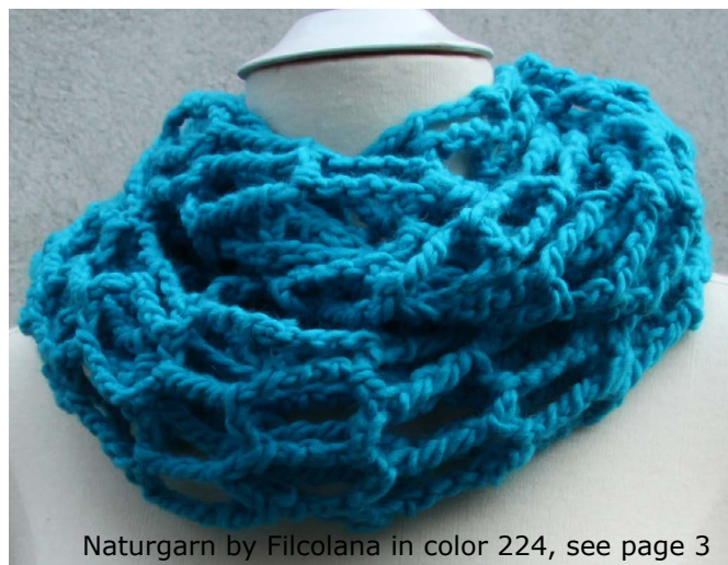
Naturgarn by Filcolana in color 224, see page 3