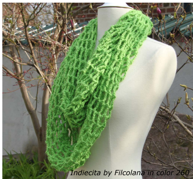
Indiecita by Filcolana in color 260