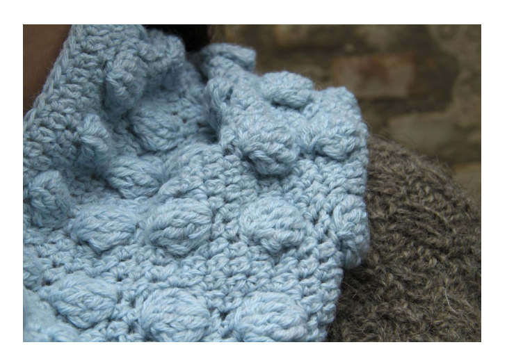
Repeat round 1-2. Round 27: Ch 1, 1 dc in every st, 1 sl st in first dc. Fasten off and weave in ends.