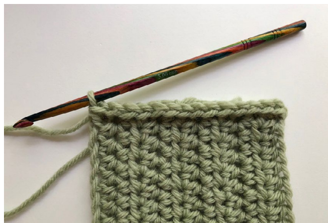
Billede 5: Maskerne lægger sig fint oven på arbejdet og danner en elegant kant.