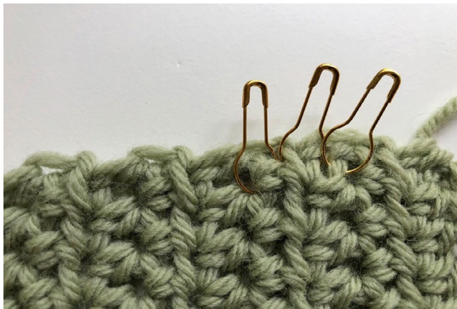
Billede 1. Der hækles 3 fm for hver 2 rk hstm, maske-markørerne indikerer, hvor der skal hækles.