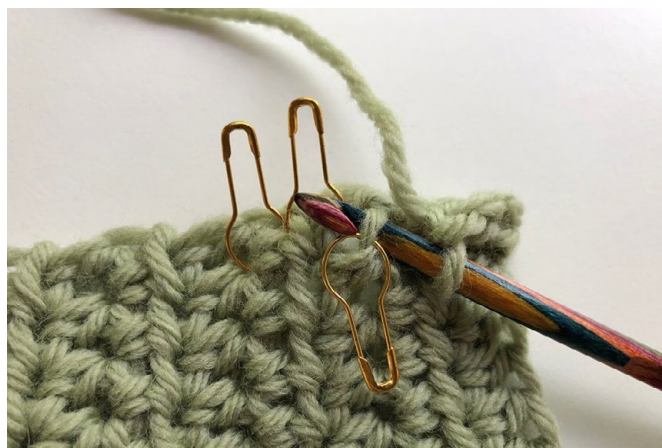
Billede 2: Ved 1. fm stikkes hæklenålen under lænken.