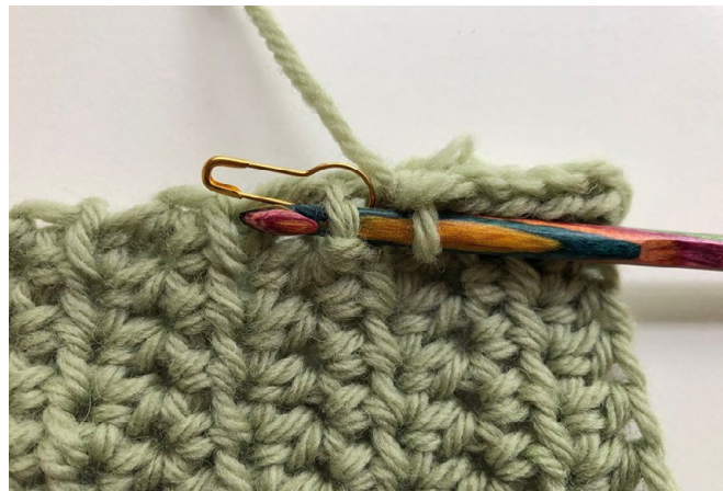
Billede 4: Ved 3. fm stikkes hæklenålen under lænkerne efter V'et.