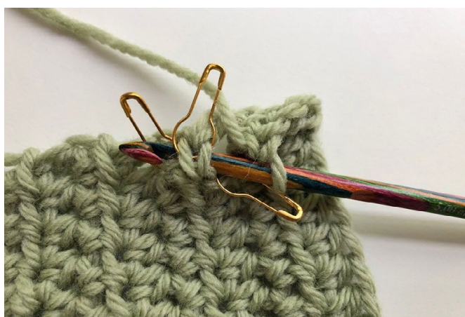
Billede 3: Ved 2. fm stikkes hæklenålen ind under de 2 lænker, der danner et lille V.