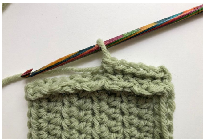
Billede 6: Næste rk: For at få vinklen på arbejdet til at passe igen, hækles der nu relieffastmasker omkring de fm, der blev hæklet på forrige rk. Billedet viser vrangsiden af arbejdet.