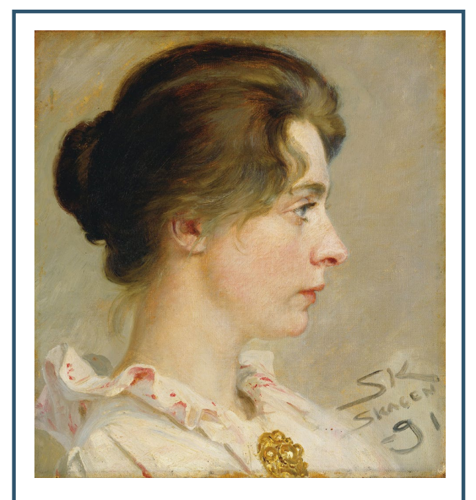
P. S. Krøyer, Marie Krøyer, 1891

knit 4 rows (the first row is a WS row) – work the edge sts as follows: Slip the first stitch either purlwise og knit-wise to fit the knitting. Knit or purl the last stitch yo fit the knitting.